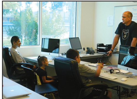
Students in the classroom at Stronghold