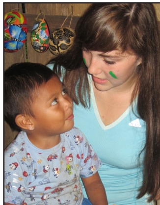
An NLC teen volunteering in Costa Rica.

The National Leadership Council (NLC), one of DiscoveryBound's most sought-after programs, plays a significant role in the lives of many high school students. Now in its eighth year, the NLC is a multi-year servant leadership program, dedicated to fostering spiritual growth, leadership qualities, and a service approach to life. Students enter the program in mid-eighth grade and graduate in the middle of their senior year. In between, they are mentored by an adult Christian Scientist, develop close relationships with their NLC peers, work on community service projects, stretch themselves on an adventure trip, develop leadership skills, and consciously focus on growing spiritually. Due to interest and demand, the program has expanded, and over 200 teens have benefited from the program!