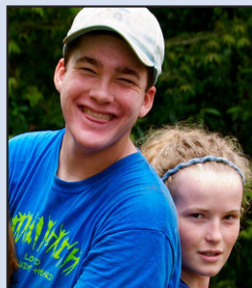
An NLC teen volunteering in Costa Rica.

129 and counting! That's the number of high school students who have graduated from the NLC program. Launched in 2005, the NLC is a multi-year servant leadership program, dedicated to fostering spiritual growth, leadership qualities, and a service approach to life. Students begin the program in the 8th grade and graduate four years later. In between, the students pursue a rigorous program of personal development, community service, and leadership training, built on a model of service to God and mankind. NLC now accepts 40 new students a year!