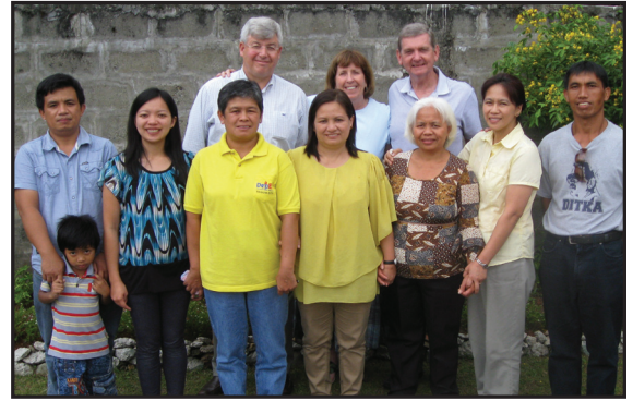
The school committee in Baguio City with the E3 team.

Most recently, the E3 team visited Baguio City, Philippines, where plans are being made to open a new school in 2016. A year's worth of hard work has gone into the planning, with budgets, government regulations, educational philosophy, meetings with church members, talking to prospective teachers, and lots of prayer all part of the mix. It was an inspiring visit with an inspired group of Christian Scientists! Visit e3schools.org to learn more about E3's activities or to make a donation.