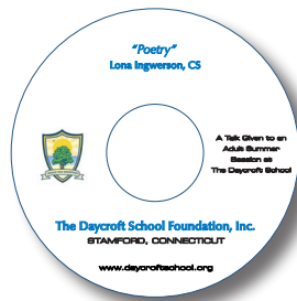
Four Talks by Lona Ingwerson, CS